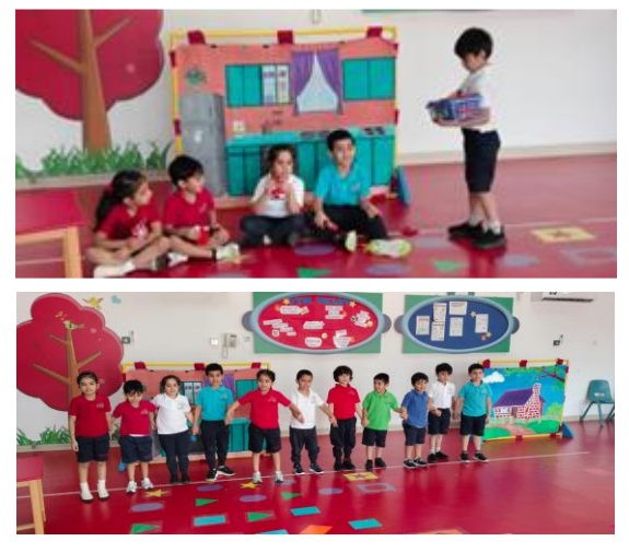
We did a great job practicing our play and we can't wait to perform it in front of our parents.