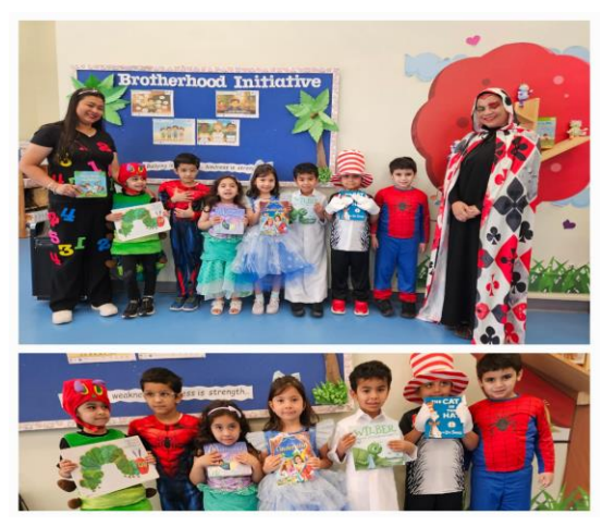
Book Week Dress up day! We looked Amazing ©