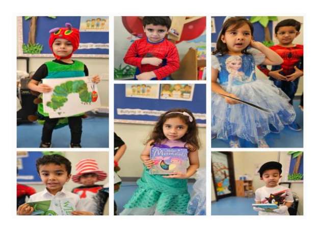
We showcased our favorite story book and dressed as the characters.

Brotherhood Initiative "Bullying is weakness, kindness is strength."