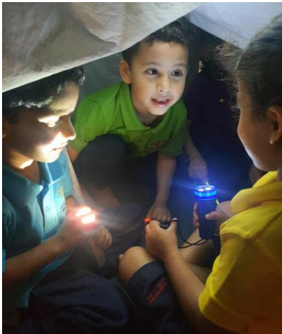
We had fun in our forts with glow sticks and torches.