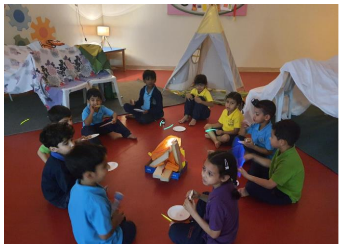
Eating smores round the campfire.

Don't forget to purchase a ticket for your child, their siblings, and other family members.