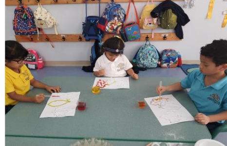
We made Autumn leaves using salt and glue. Once dry we coloured the salt leaves with food colouring.