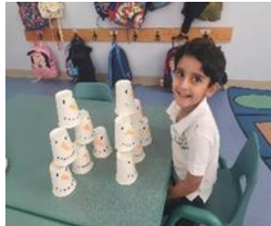
We sorted Autumn leaves and made snowman towers.