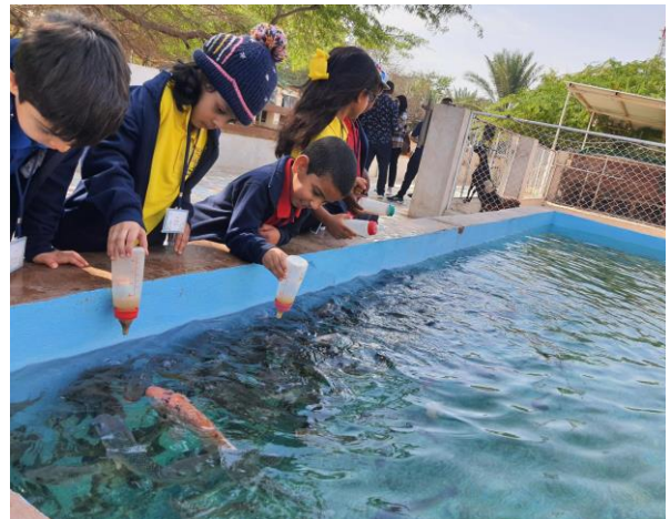
Feeding the fish at the farm.

During the week we will be collecting pet food to donate to the pet rescue center to support taking care of their animals.