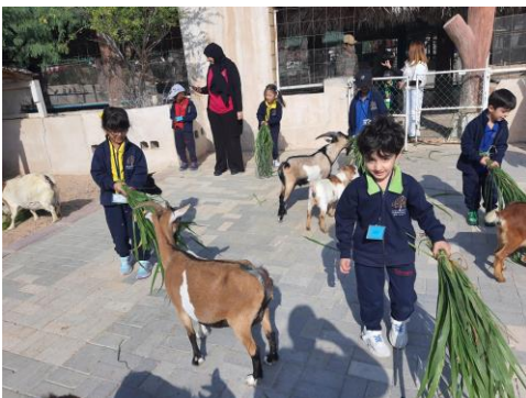
We fed the goat's grass. The children and the goats were very excited to see each other!