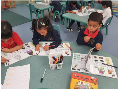
Working hard in our phonics books.